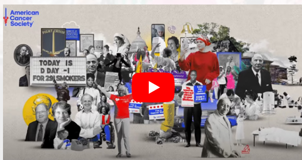
110 Years of Wins Against Cancer

In addition to research, ACS provides essential services to patients and their families, including free transportation to treatments, lodging for those traveling for care, and a 24/7 helpline offering support and information. ACS also advocates for policies that improve access to care and promotes education on cancer prevention and early detection. Through its comprehensive efforts, ACS continues to make a powerful impact in the fight against cancer.