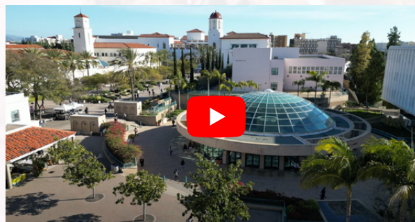
Access to Care in California - Discovery